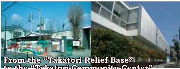
From the "Takatori Relief Base" to the "Takatori Community Center"

Located in an area where 10% of the residents are of foreign nationality, the Takatori Community Center is the successor to the "Takatori Kyuen Kichi" (Takatori Relief Base), which acted as a hub for the Takatori Catholic Church's volunteer efforts after the Great Hanshin-Awaji Earthquake of 1995. As time went on, the Center evolved from a facility providing emergency relief to local residents, to one that houses numerous organizations with the shared aim of building a community where multicultural coexistence is an everyday reality. In the year 2000, the Center was reestablished as a legal entity and came to be known by its current name.